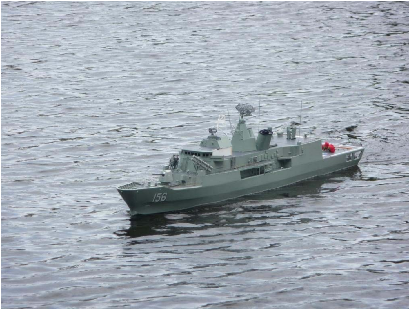
TOOWOOMBA in the sun