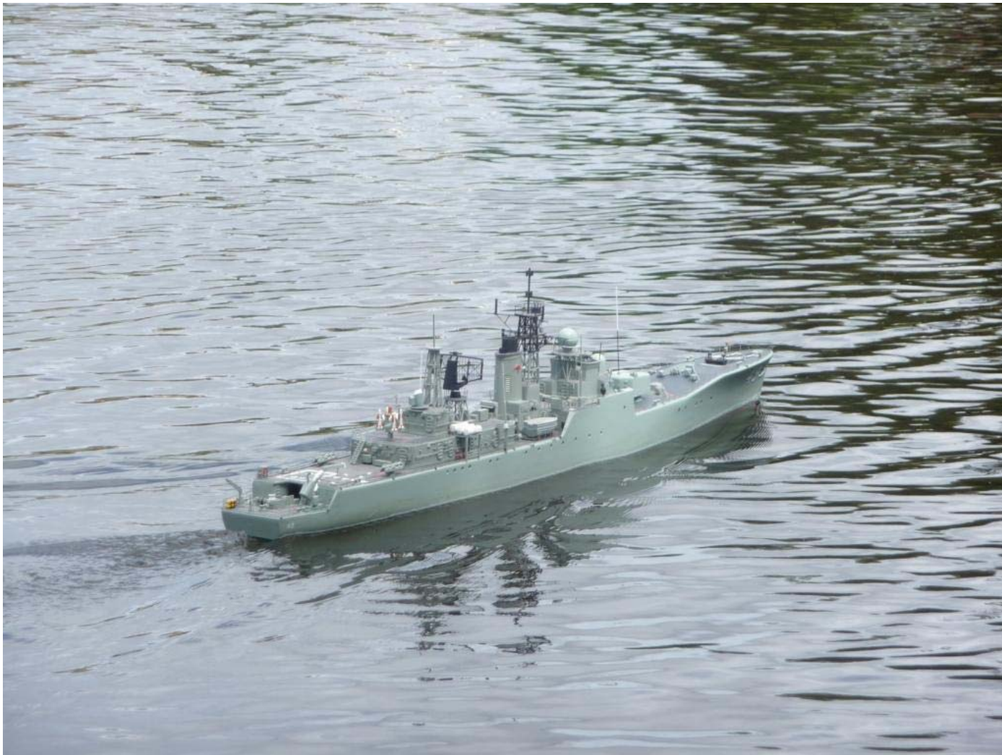
Glenn's very nice HMAS DERWENT