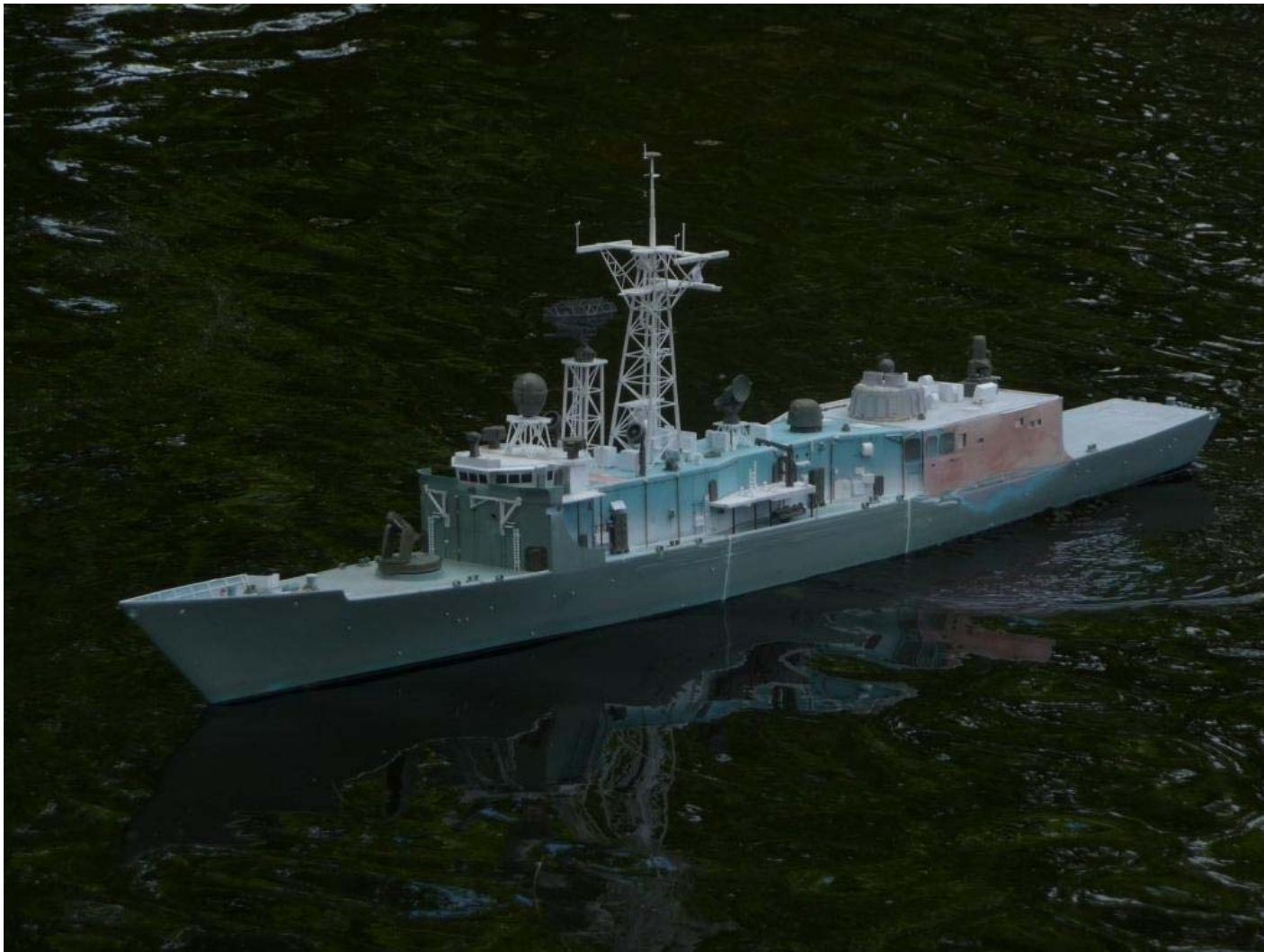
Pete's HMAS DARWIN - almost ready to paint