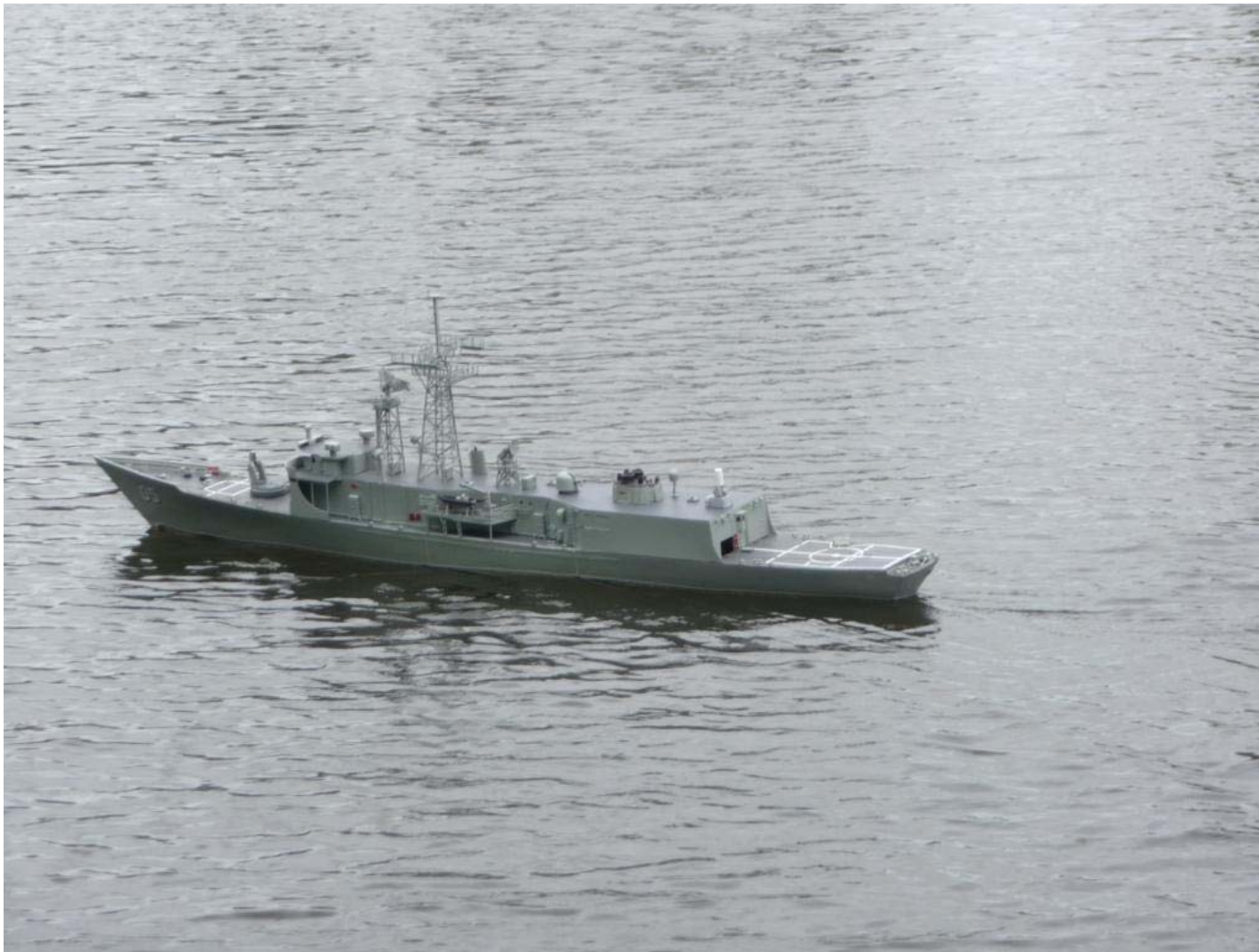
HMAS MELBOURNE cruises the lake