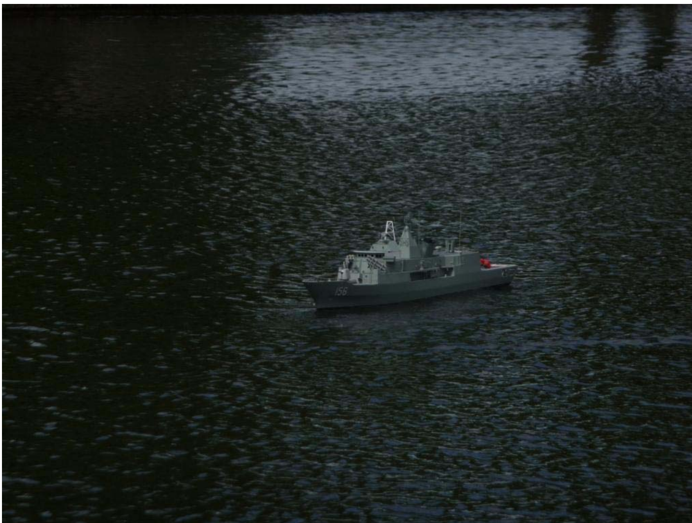
The red poppies on TOOWOOMBA stand out under black skies