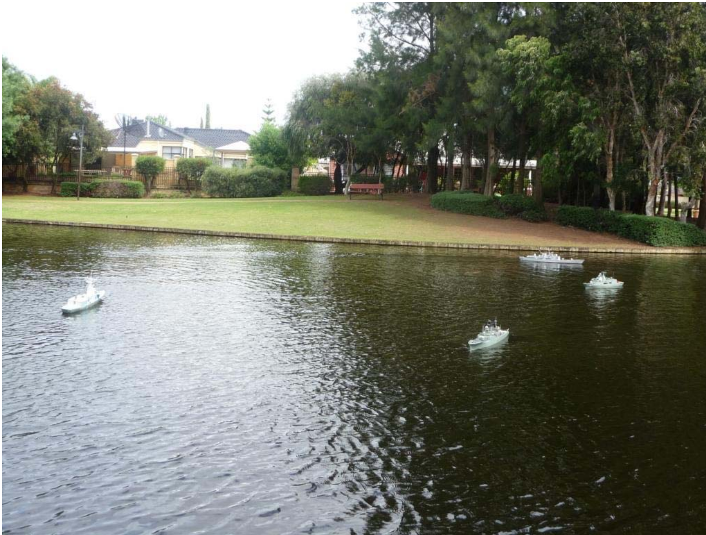
Forming up for a ceremonial column