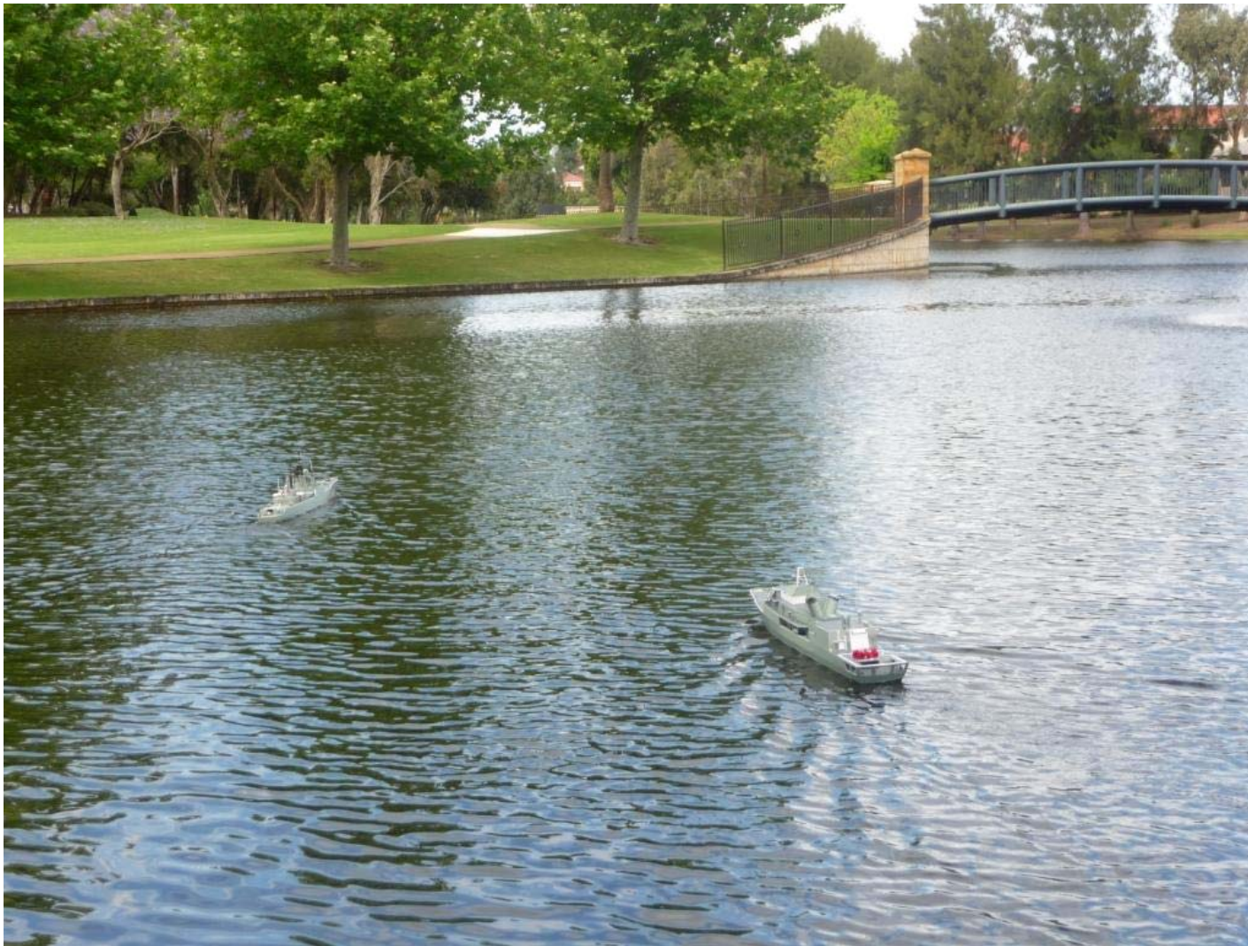
HMA Ships DERWENT and TOOWOOMBA heading out together