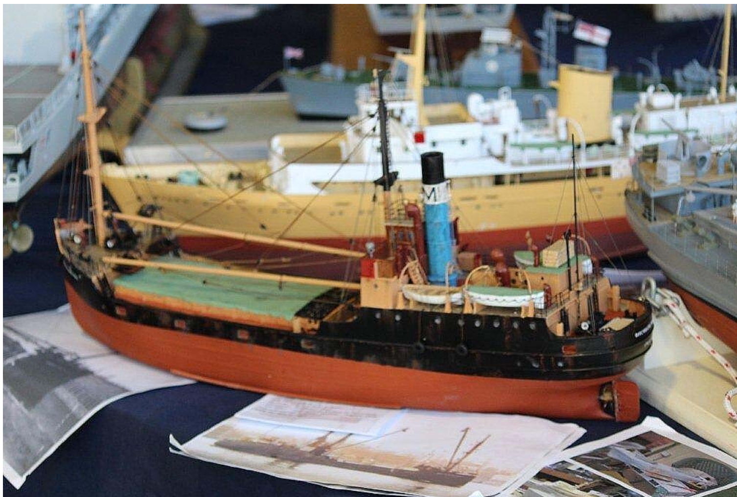
One of the growing number of merchant vessels in the Task Force 72 fleet. This one is BIRCHGROVE PARK (Geoff Eastwood).