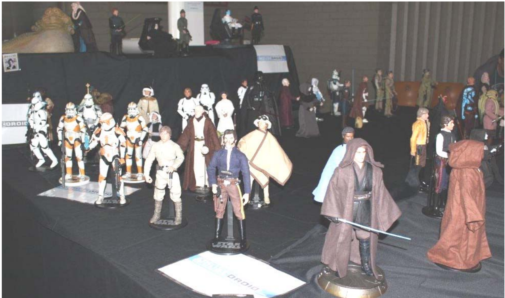
Our Town is well worth a visit for anyone with an interest in modelling and there is something for everyone. These are the 300mm figurines from Star Wars.