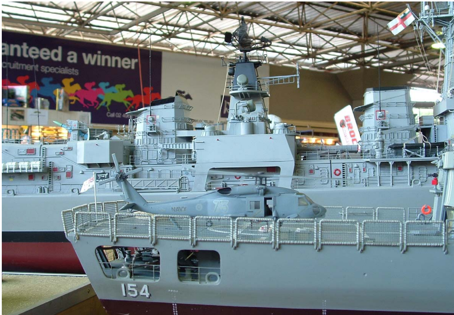
Quarterdeck and Flight Deck of HMAS PARRAMATTA with INS MUMBAI in the background.