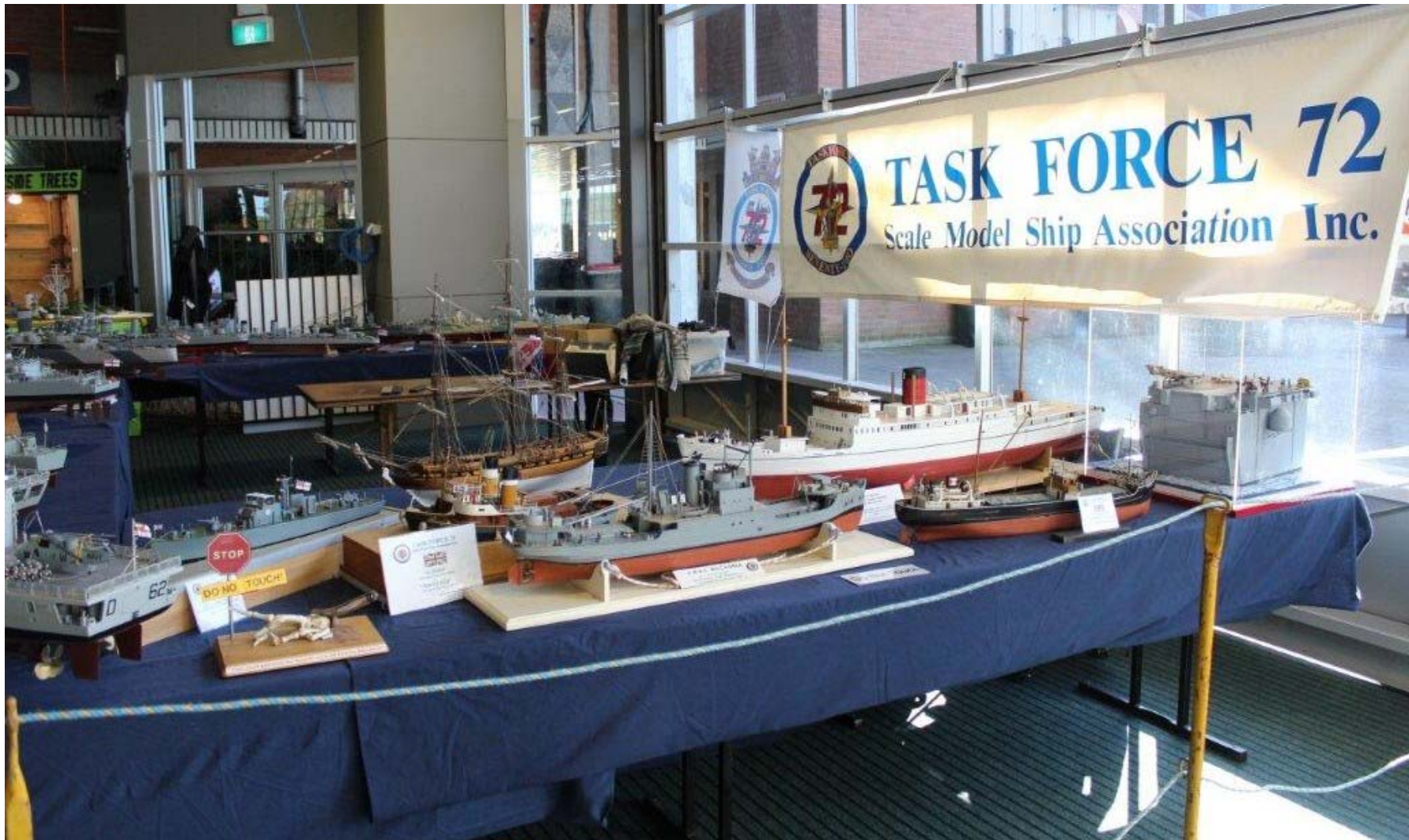
The Task Force 72 display at the Our Town Model Show 2011.