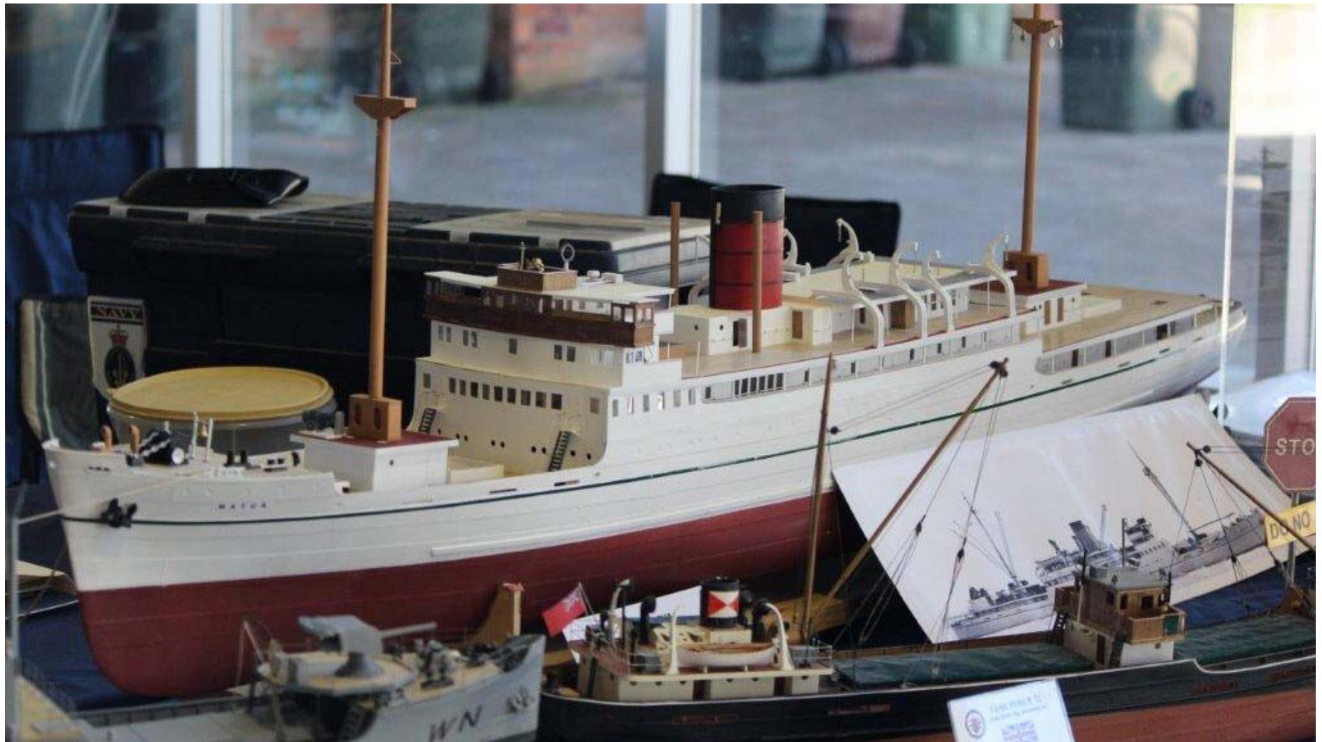
MV MATUA.