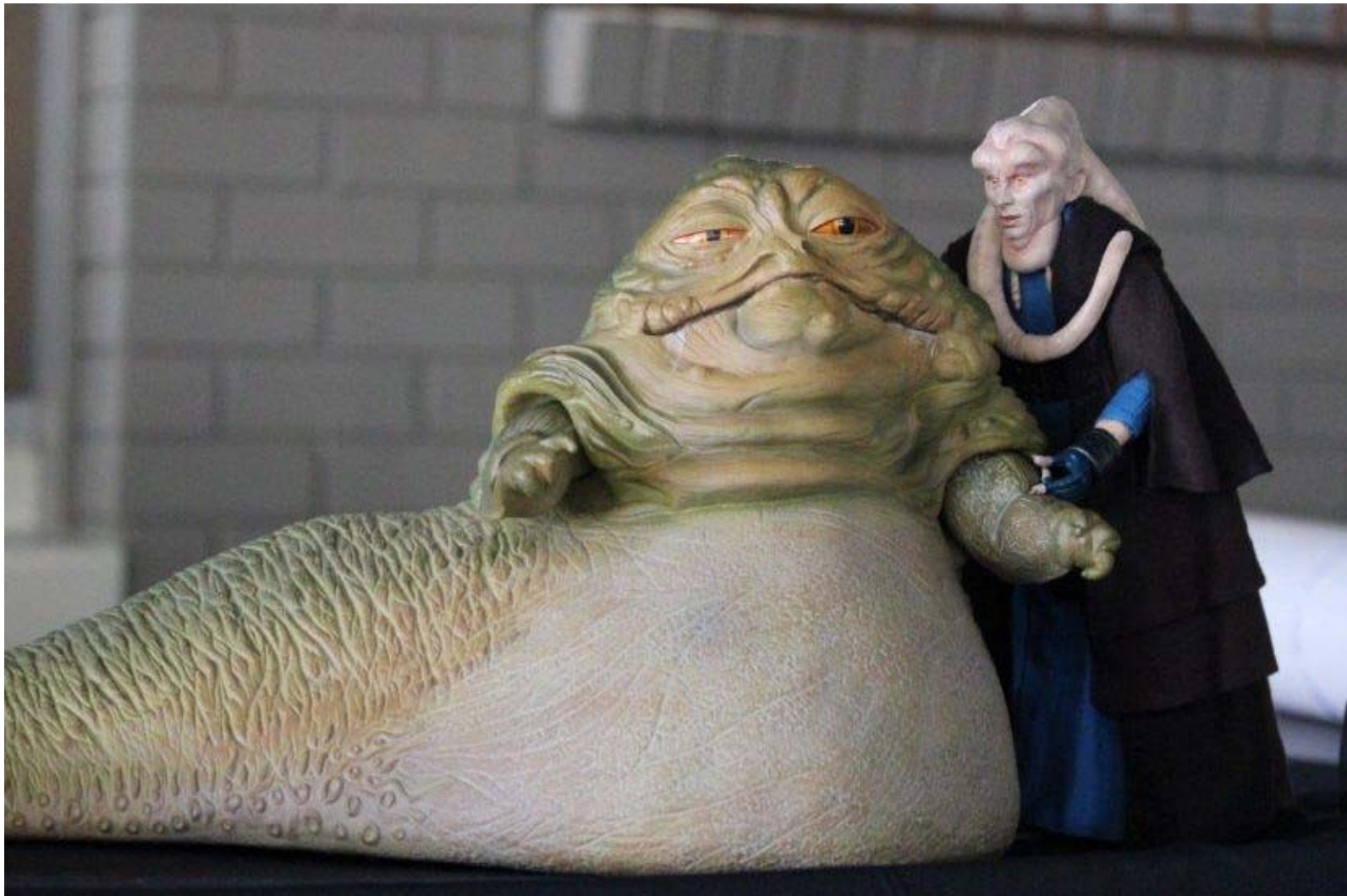
Jabba the Hut.