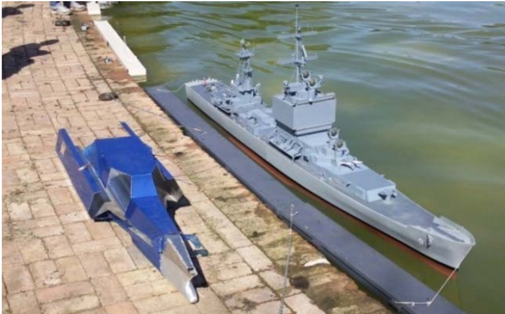
LCS2 hull alongside my USS LONG BEACH, note the massive Beam of the LCS2!