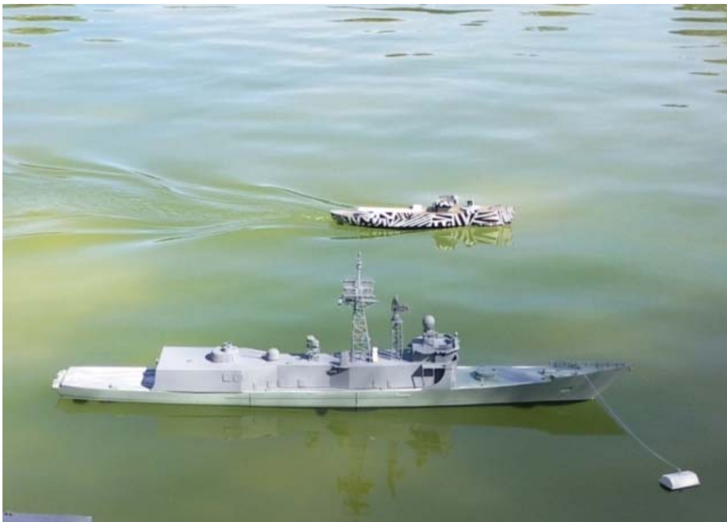
HMAS SYDNEY at the buoy as the zebra passes behind