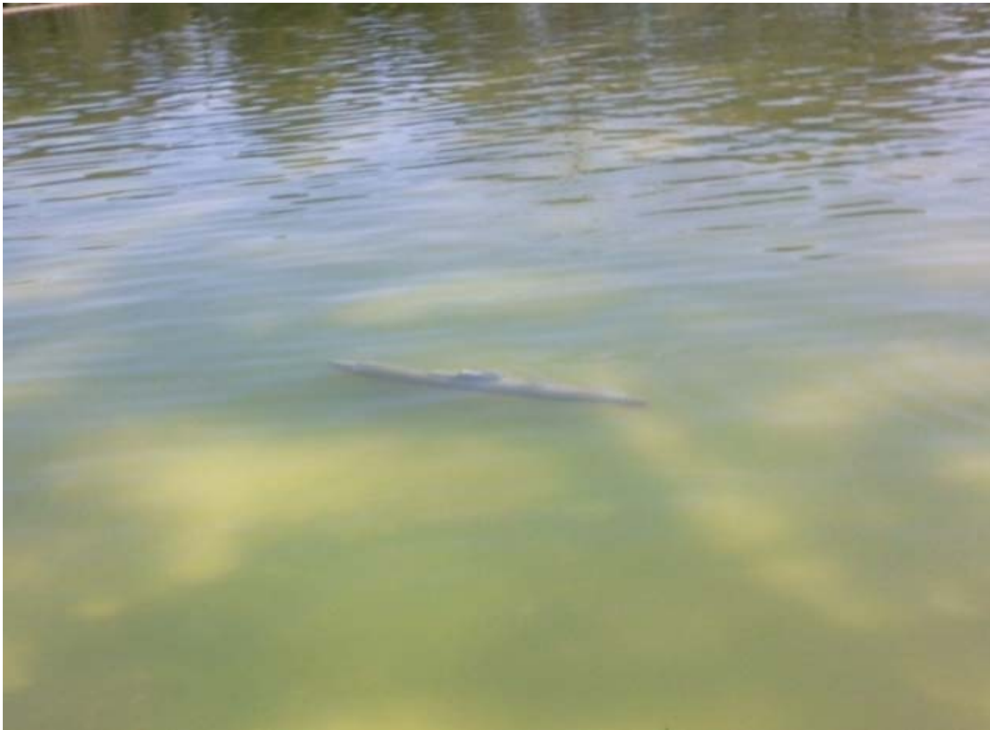
Lurking beneath as the pesky corvettes circle above