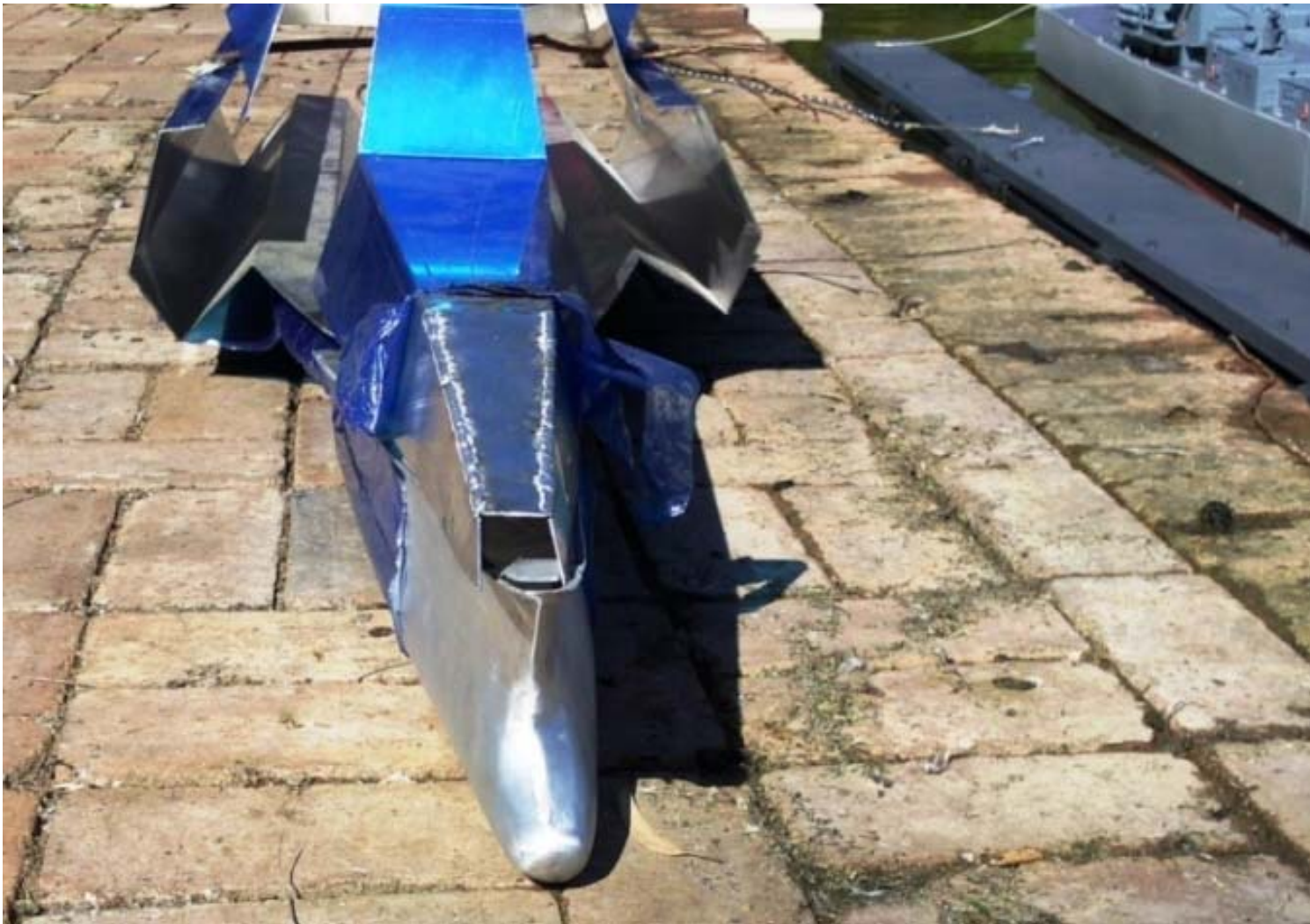
LCS2 bow (this has been welded then filed smooth!)