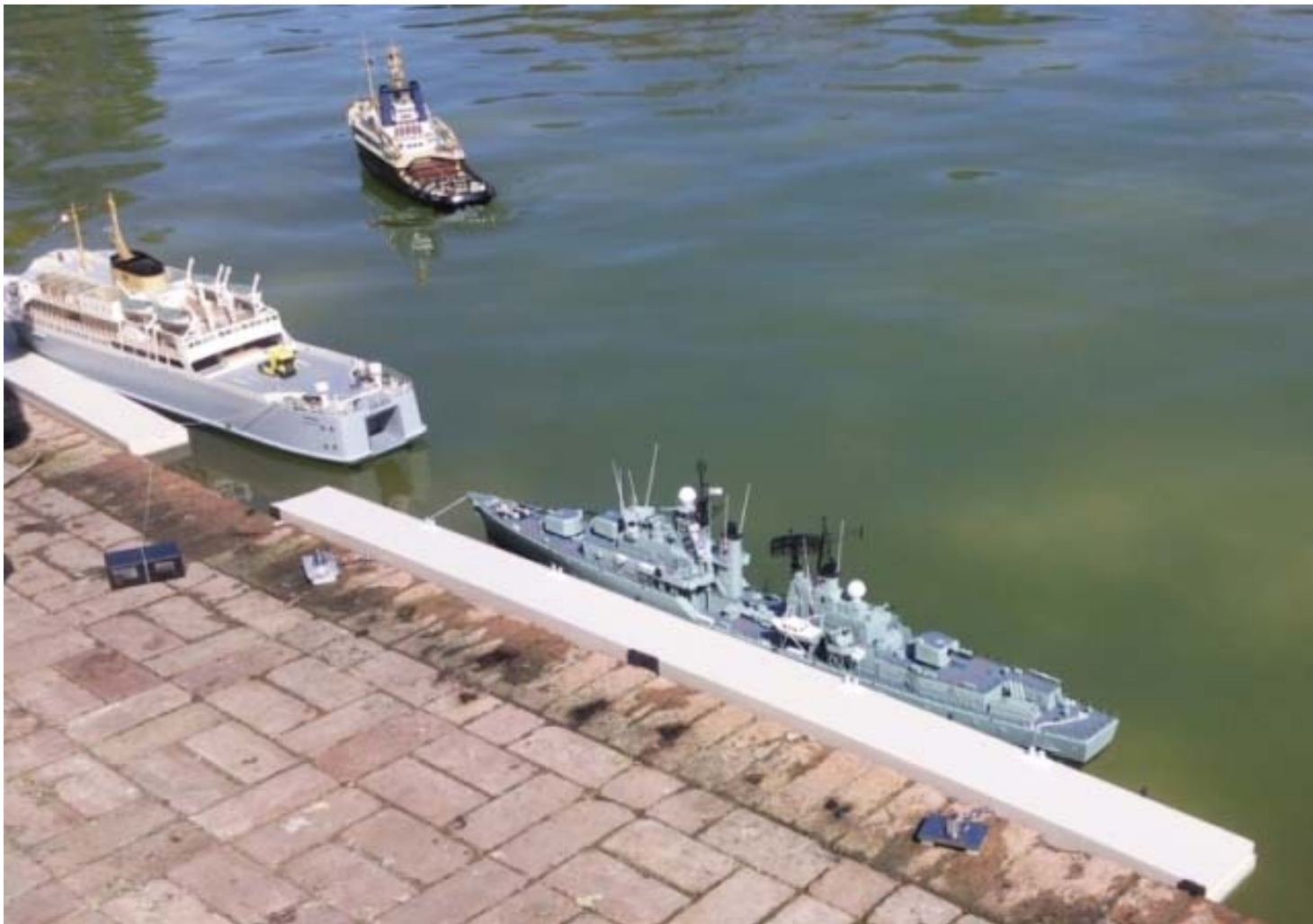
VAMPIRE with Gunter Schefe's 1:50 MV TROUBRIDGE and SMIT ROTTERDAM