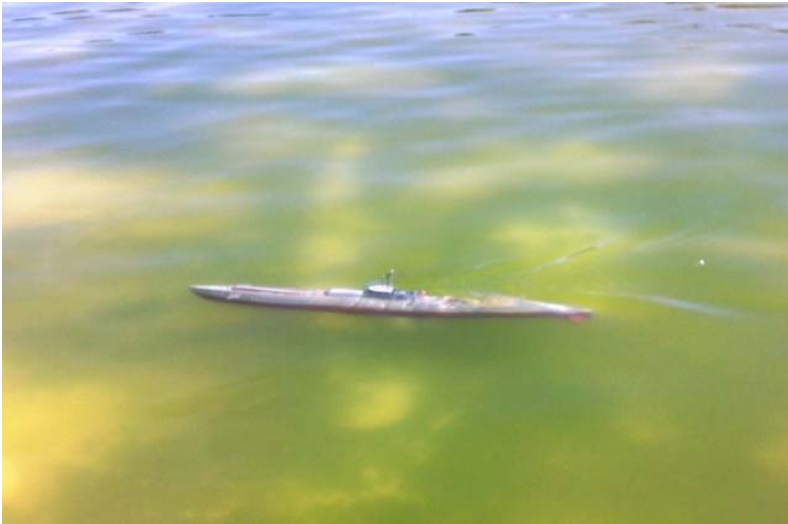
I-25 patrols at periscope depth after repairs