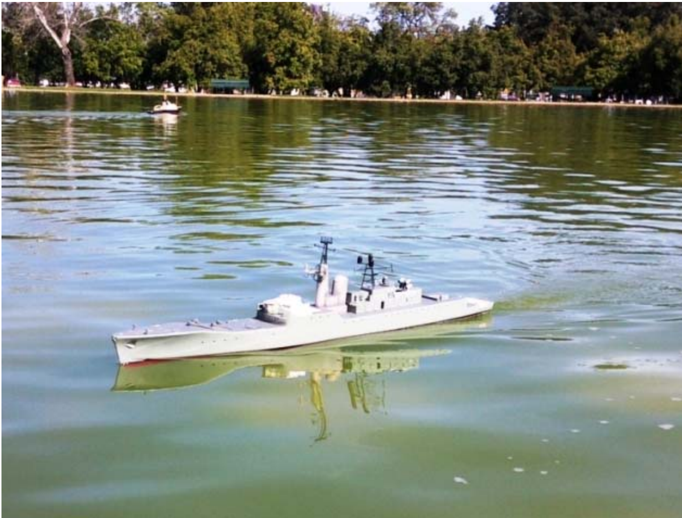
HMAS PARRAMATTA III (Brenton Tancock) cruises the waters