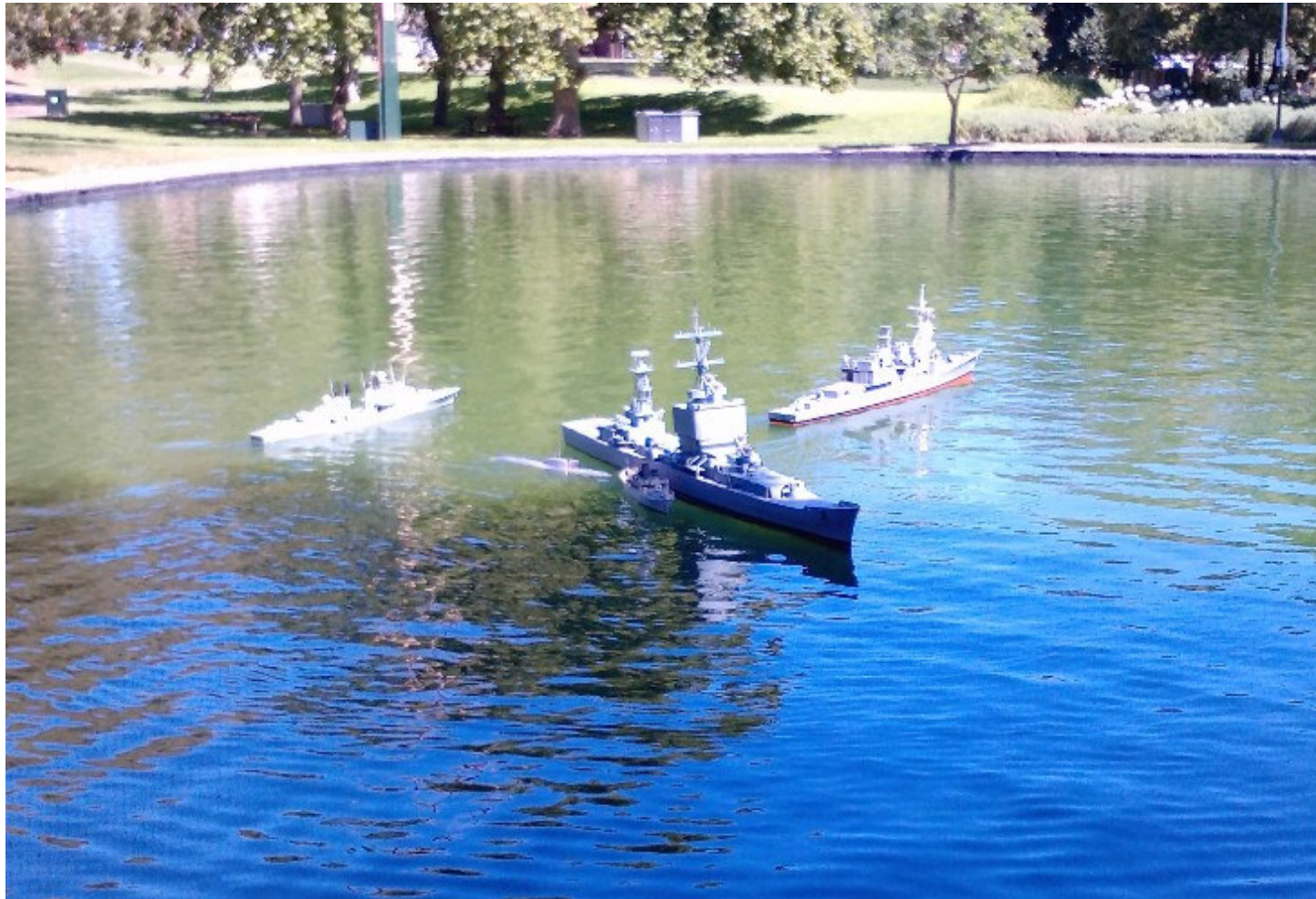
Using Long Beach as a tug to try and get Saucy back inshore