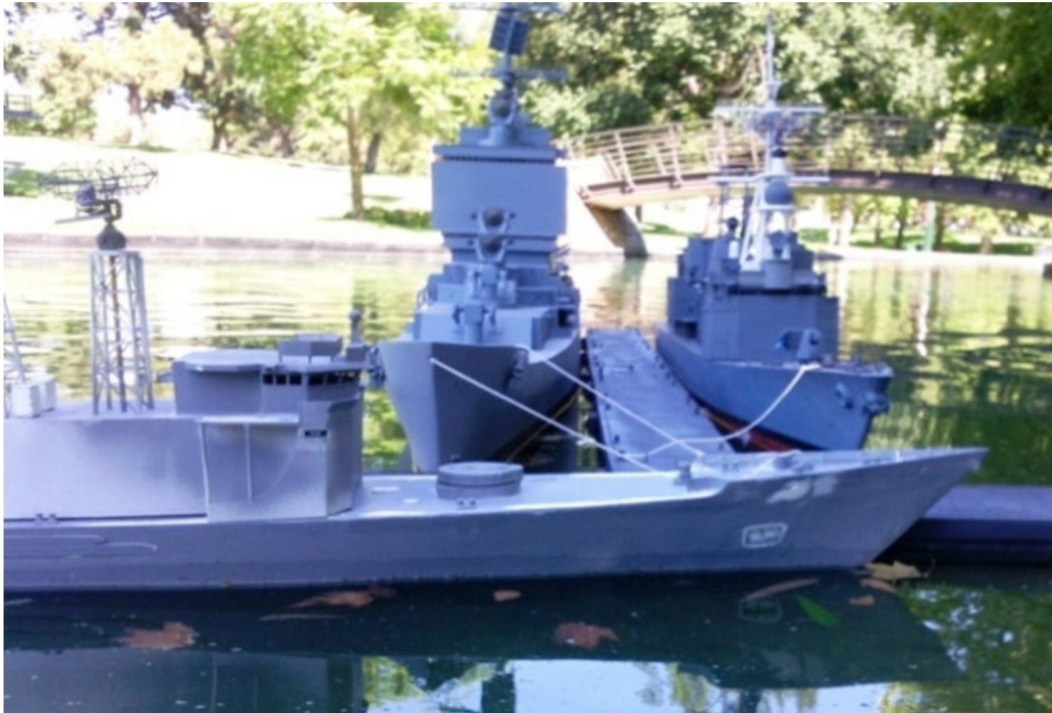
Three FBGW ships at rest at the pier.