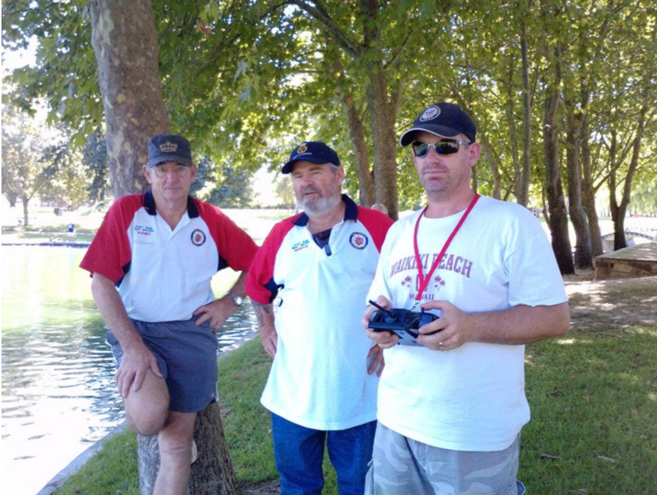
Some of the piratical crew of Fleet Base Gulf Waters