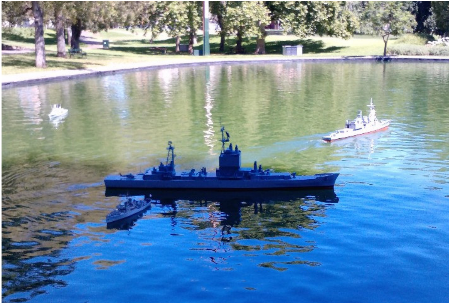
Slowly but surely Saucy moves closer to the shore