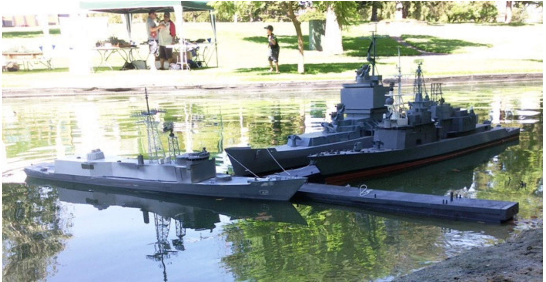
Adelaide, Long Beach and Scott seek shade from the scorching heat