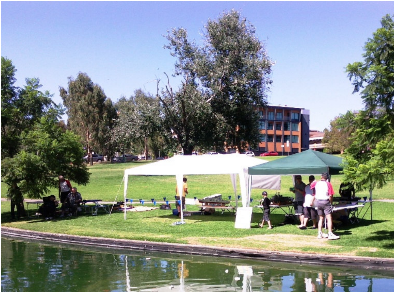
The Task Force 72 Fleet Base Gulf Waters mobile HQ, temporarily erected at Rymill Park