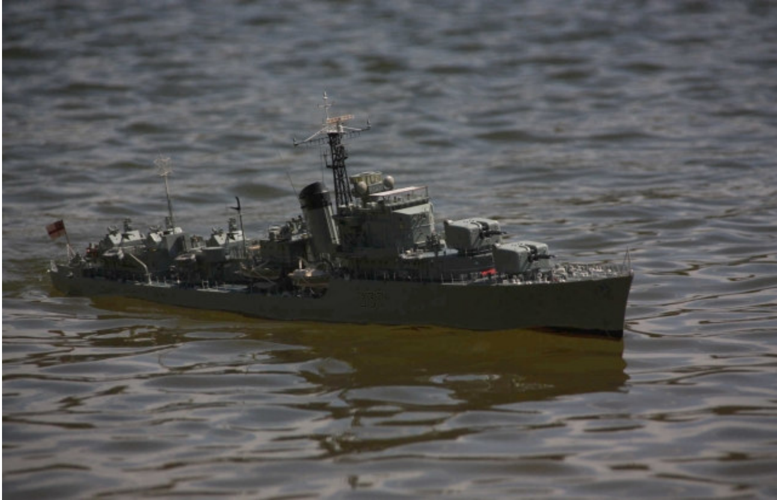
Australian Battle class destroyer HMAS Tobruk