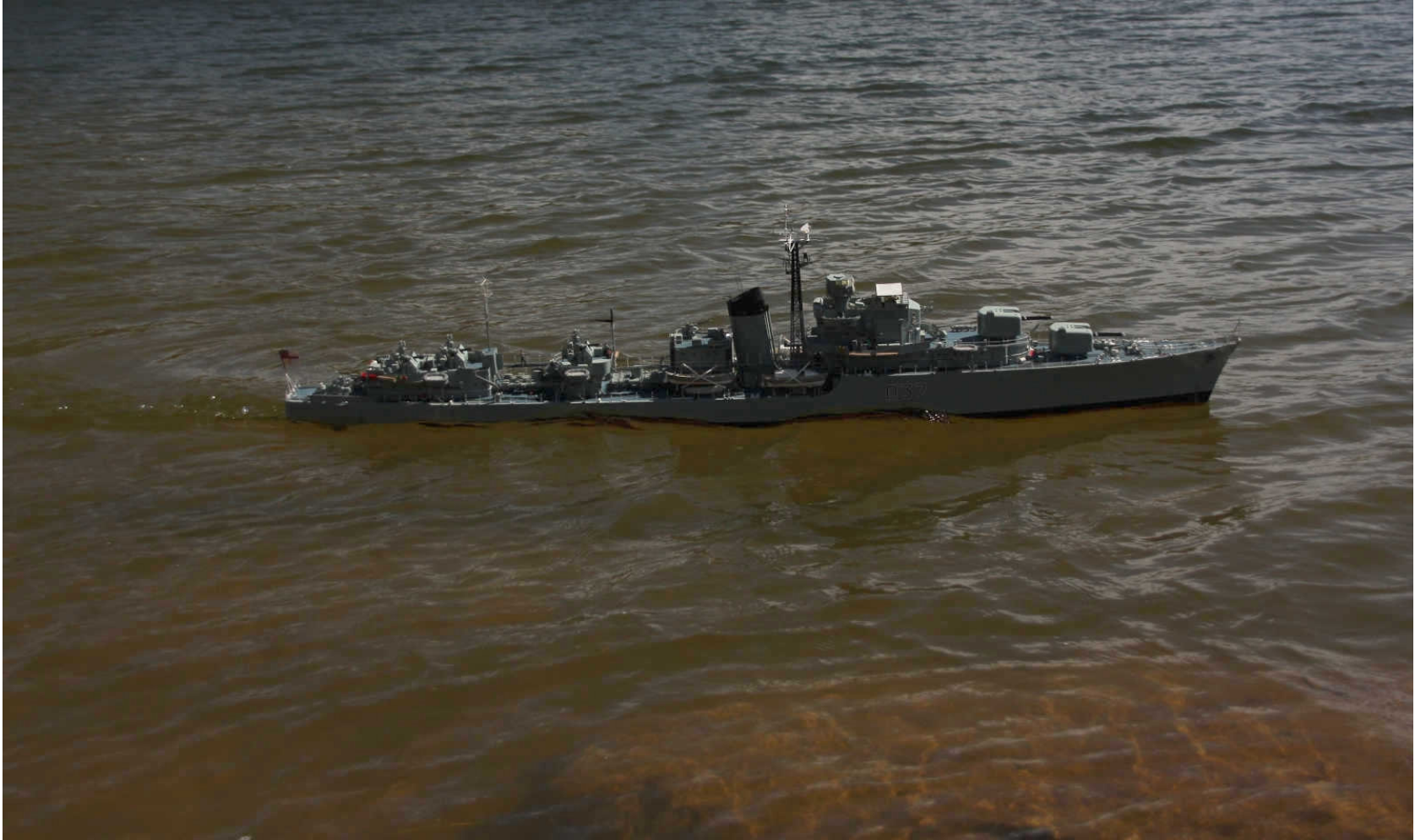
Tobruk skirts the shoals