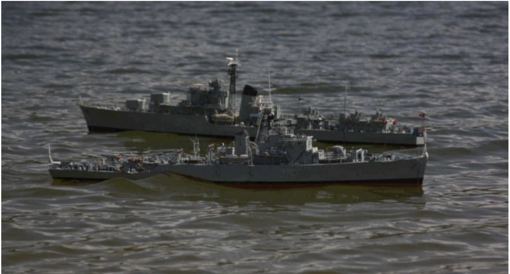
Australian River class frigate Condamine and Battle class destroyer Tobruk manoeuvre together