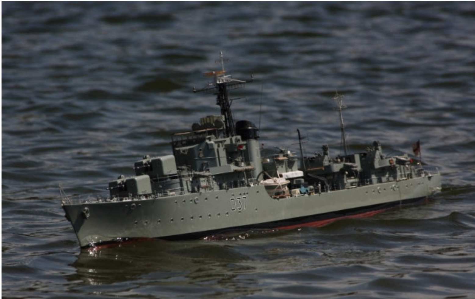
Tobruk showing the fine lines of a classic destroyer