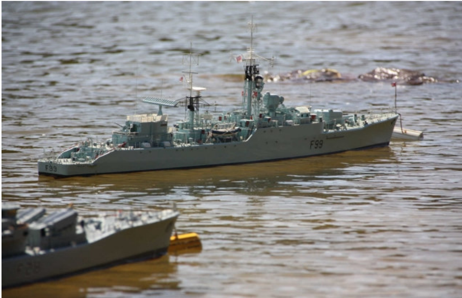
RN air defence frigate Lincoln rests near rocks