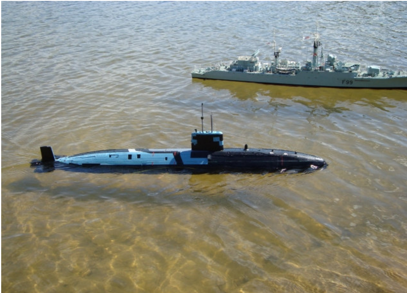
Trenchant passing Lincoln on her sea trials