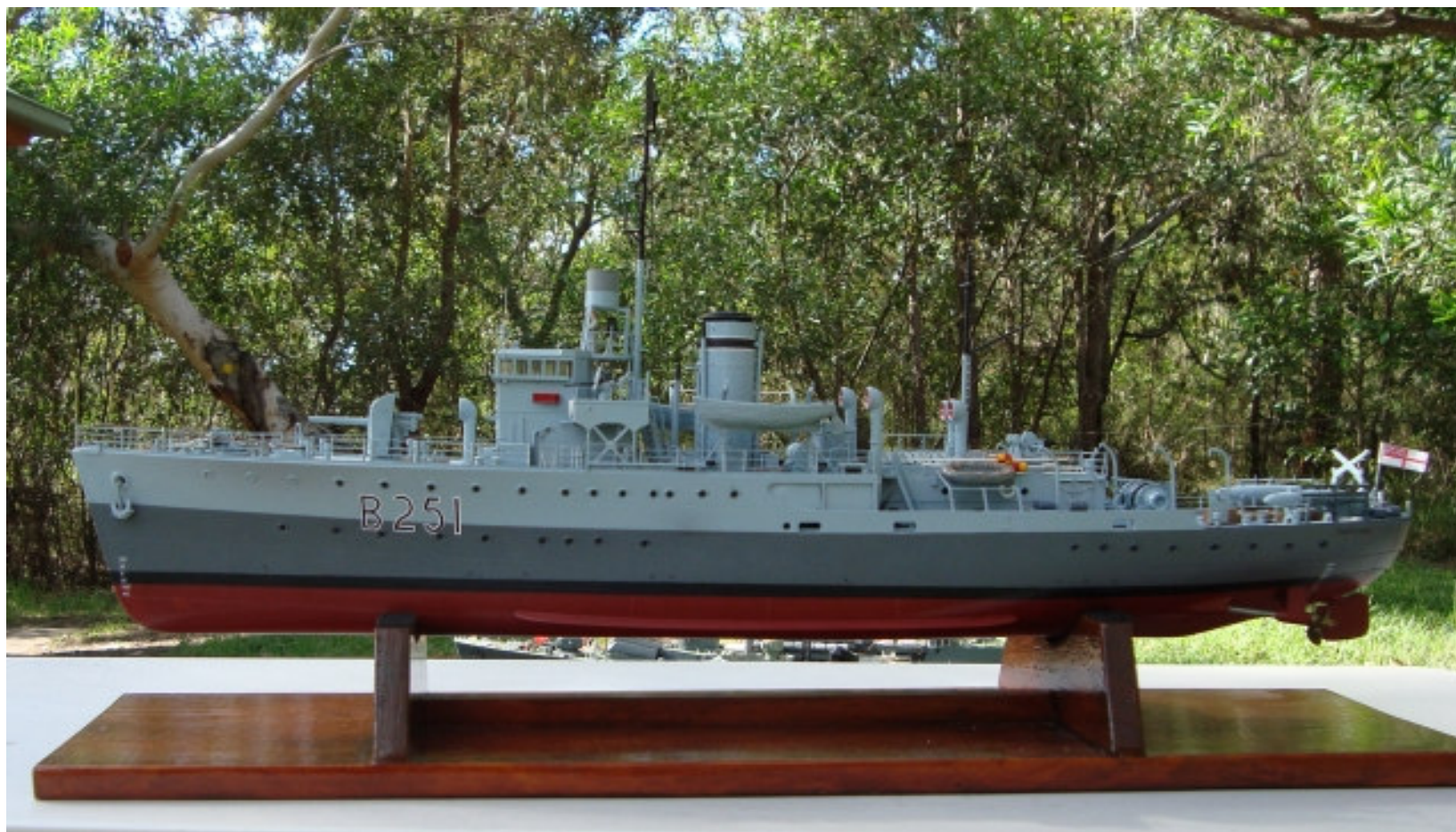
Mark's WW2 Bathurst class minesweeper HMAS Toowoomba